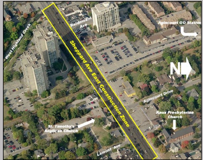
Work Zones on Sheppard Avenue East

Work will generally take place from 7:00am - 7:00pm, Monday to Friday with weekend work and overnight work as required.