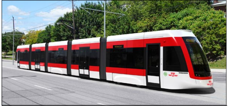
BOMBARDIER LIGHT RAIL VEHICLE

Bombardier's Light Rail Vehicle to be used on all Transit City projects will have significant service improvements, including: